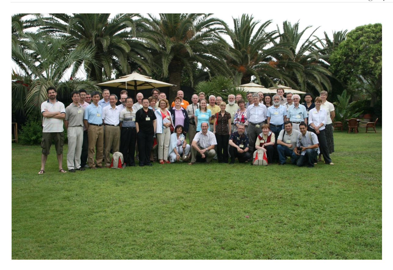
Group photo at the conference in Villasimius Sardinia.