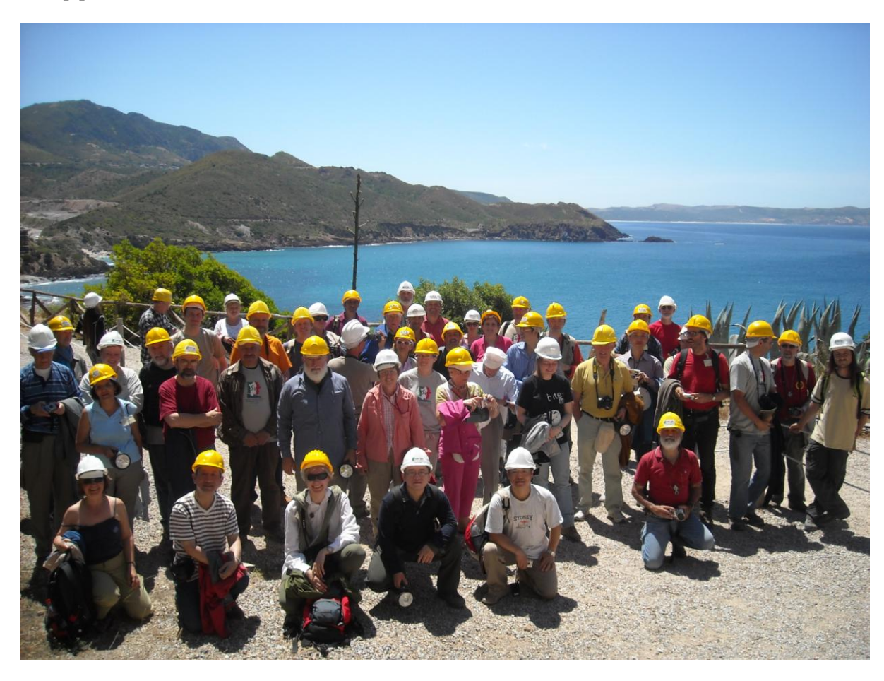
Group photo during the excursion when visiting the old port of Porto Flavia, a mineral charging installation, excavated in the mountain with access to boats in the sea.