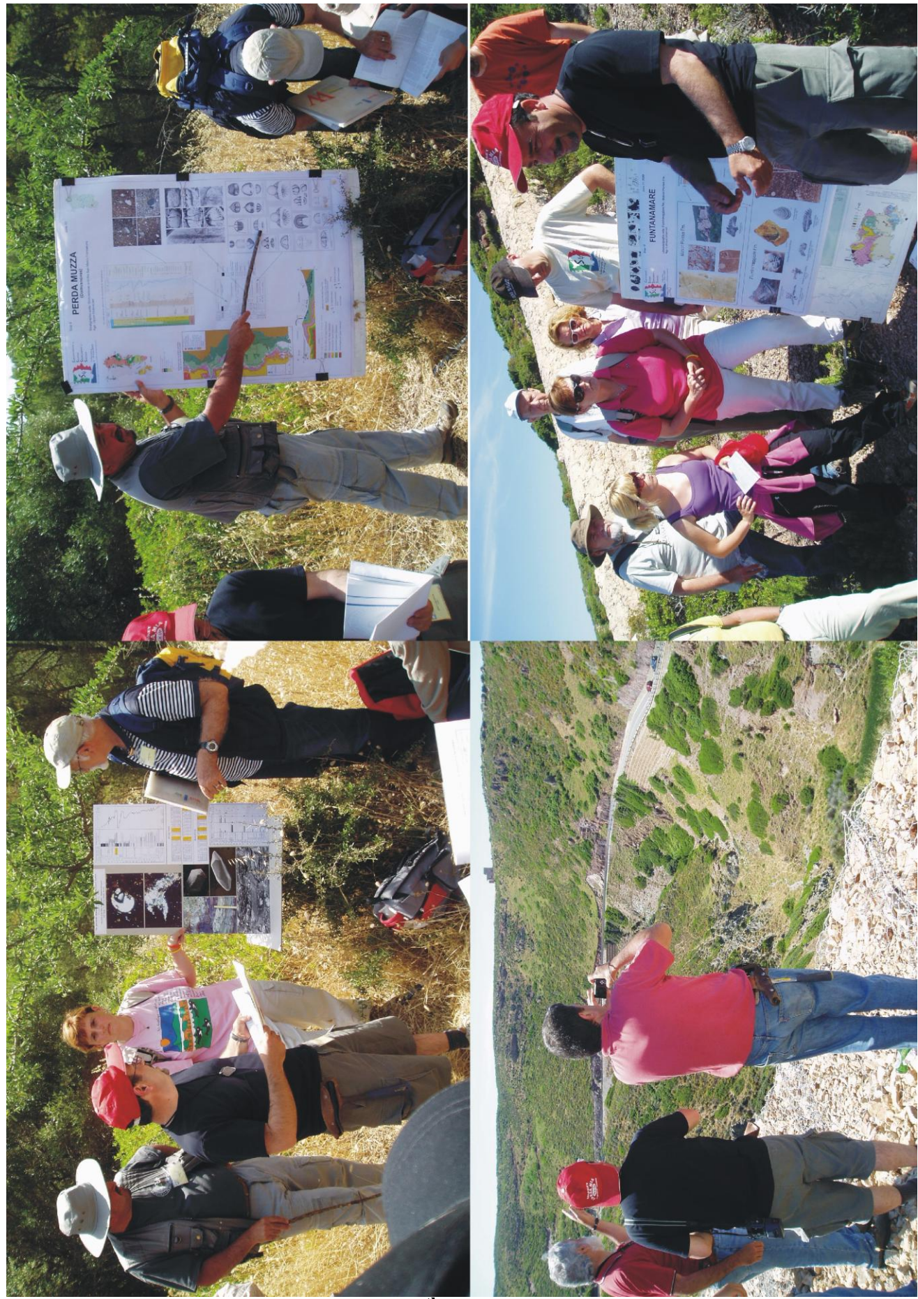
6.2. Paleozoic Seas Symposium (14-18<sup>th</sup> September 2009, Graz, Austria)